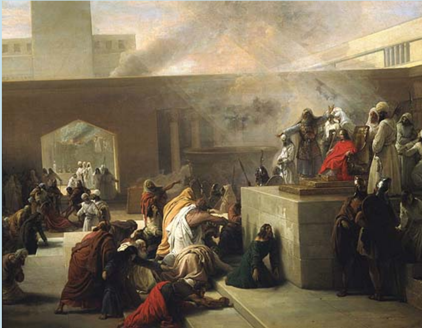
"The coronation of Jehoash", Francesco Hayez (1860), Revoltella Museum in Trieste